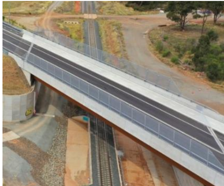
SAP Bridge #2