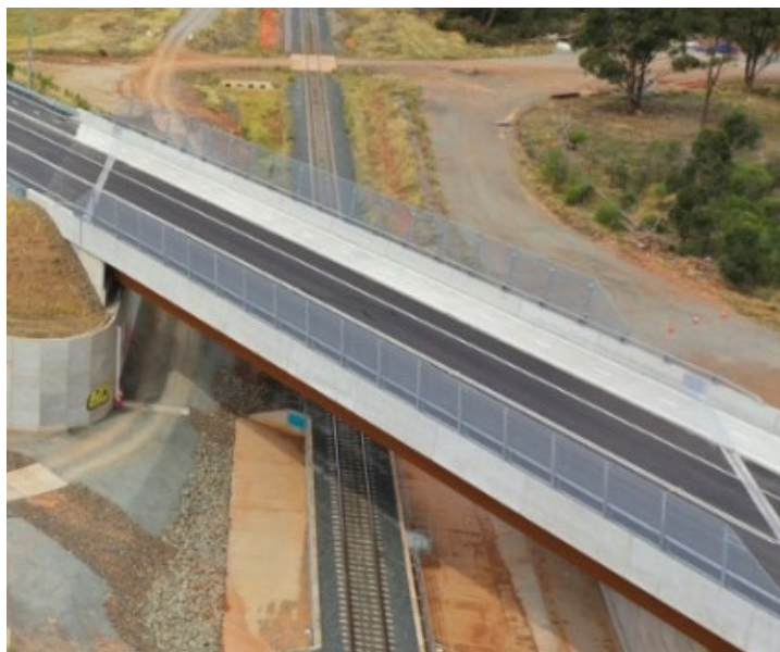
SAP Bridge #2