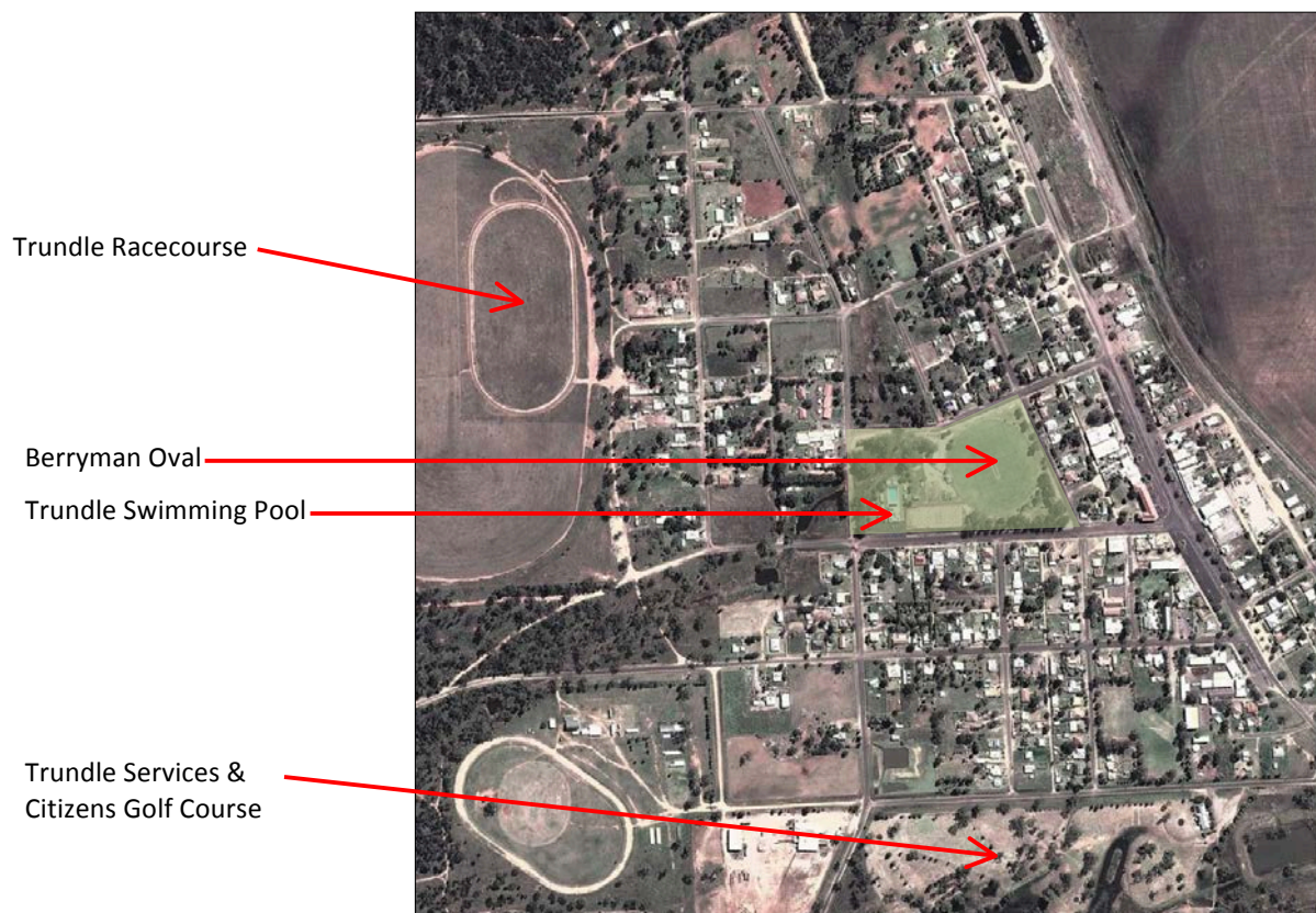
Figure 1 – Aerial View of Berryman Oval Reserve

Berryman Oval Reserve is the main sporting and community recreation precinct in Trundle. It is located west of the main street of Trundle (The Bogan Way) and is bounded by Hutton Street to the north, Brookview Street to the west, Parkes Street to the south, and the Gobondery Street to the east. (See Figure 1)